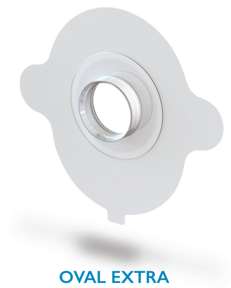
OVAL EXTRA BE 6084