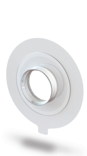
ROUND BE 6082

AccuFit® Adhesive Housings are designed to be our strongest adhesive option while still maintaining flexibility. Its increased elasticity is less prone to tearing.