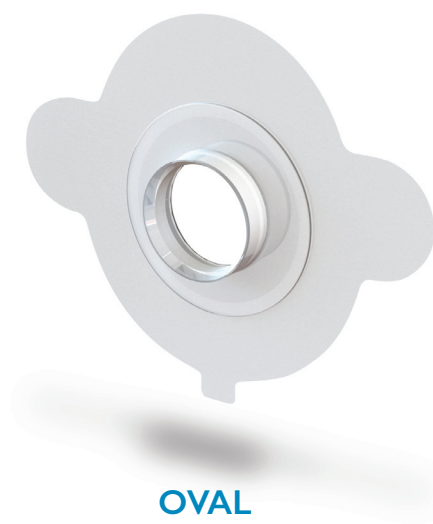
OVAL BE 6083