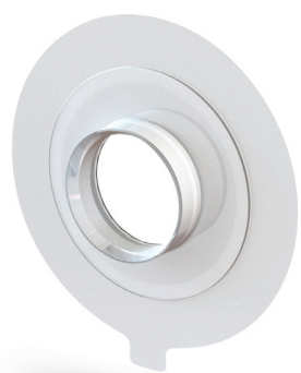
ROUND BE 6082

AccuFit® Adhesive Housings are designed to be our strongest adhesive option while still maintaining flexibility. Its increased elasticity is less prone to tearing.