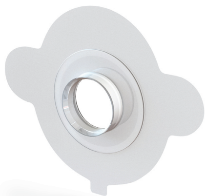
OVAL BE 6083