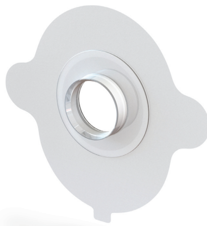
OVAL EXTRA BE 6084